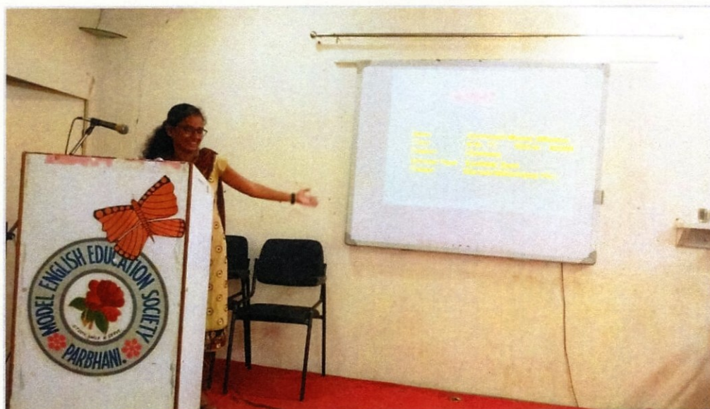
Student delivering the Seminar on Synthetic Dyes

Principal Sharda Mahavidyalaya (Art's & Science) Parbhani